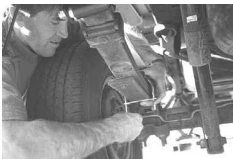
Installing the mounting bracket with U-bolts