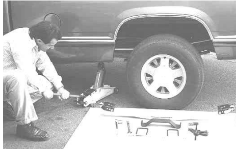
Jacking the vehicle