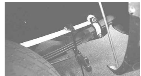
Use the C-clamp to hold down the SuperSpring