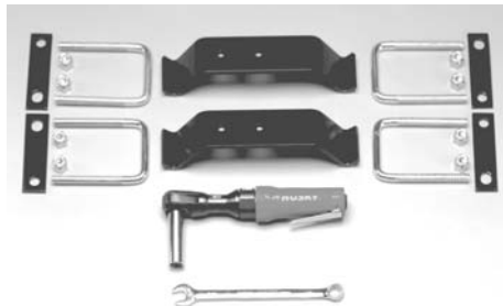
U-Bolts, Mounting Bracket and Wrenches

Ensure brake cables are not touching the SuperSprings blade(s). Secure them out of the way with zip ties or re-routing.