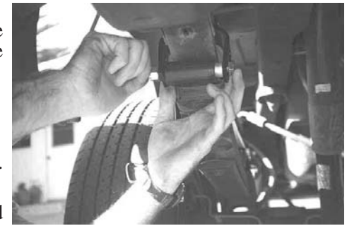
Attaching the shackle (lower bolt and nut)