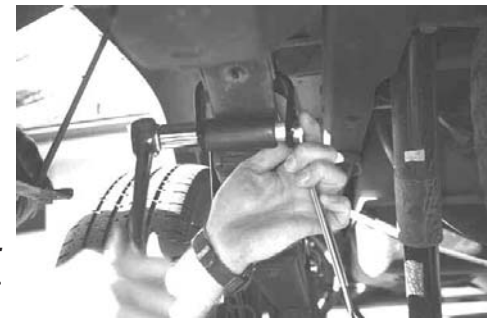
Tightening the shackle (lower bolt and nut)