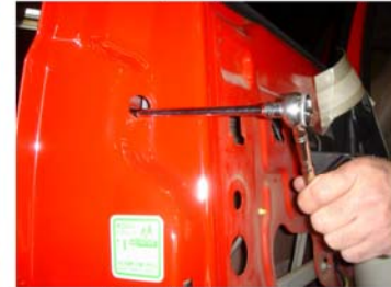
There are 2 (two) 7/16 nuts holding the bucket in the door. Remove nut #1