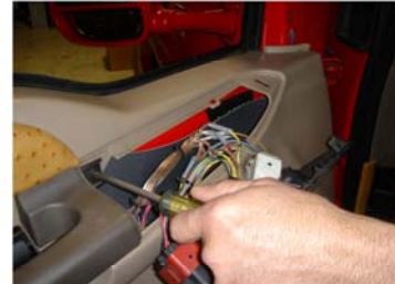
Unscrew door panel bolt #1 (may be either 9/32 or phillips head screw)