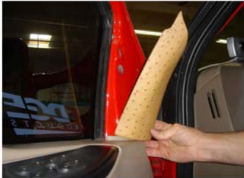
Front Door Panel Removal starts by Unclipping the front corner panel