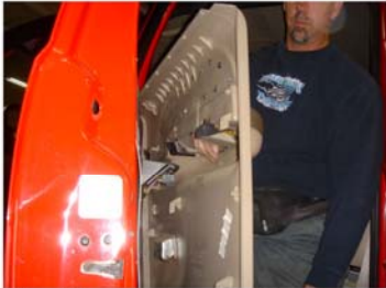
Lift off door panel and set aside