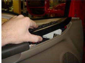
Unclip Switch Panel