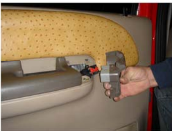
Unclip harness and set switch plate aside