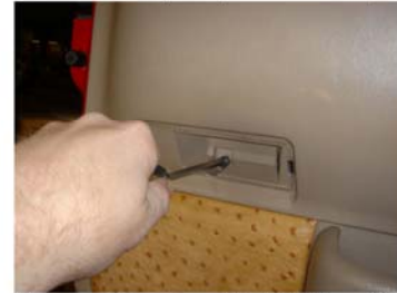
Unscrew door panel bolt #2 (may be either 9/32 or phillips head screw)