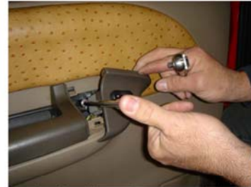
Rear Door Panel Removal starts by unclipping switch plate and removing door panel screw #1

Once the Latch Rod and Lock Rods have been detached the bucket can be removed from the door and set on the bench until you are ready to replace the Flip Latch Handle