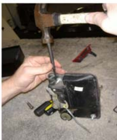
Tap the Flip Latch Pivot Pin into its lock position. You will see two small plastic detents that hold the pin in place