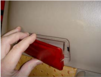
Unclip red lense at the front edge