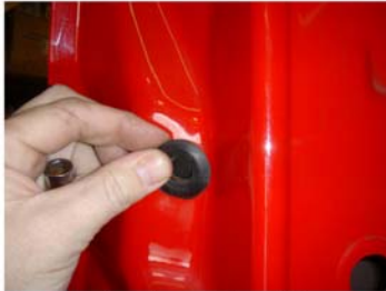
Remove plug from edge of door