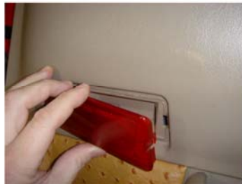
Unclip Lens from the front edge