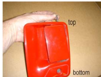
Lift out the pivot pin and remove OE Flip Handle