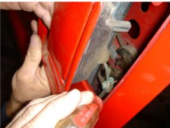
Release latch rod at the (aqua) quick disconnect clip from the outside edge