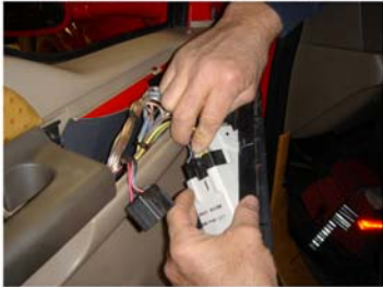
Unclip switch Panel harness