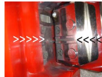
Line up the New Grippin Billet Handle NOTE: there is a slot you need to align