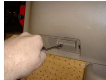
Remove Door Panel Screw #2 from behind lens Lift off Door Panel and remove Handle from Door