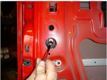
Remove nut #2, Note: an open end wrench may also be used