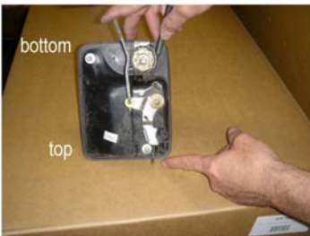
The Handle Pivot Pin is removed with a light tap pushing the pivot pin past the retaining tabs