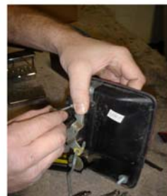
Mount the bolt (provided) in the back of the handle. This bolt will operate the rod actuator

Note #1 Attached the Lock Rod and actuator before mounting the bucket to the door