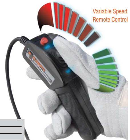
Variable Speed Remote Control