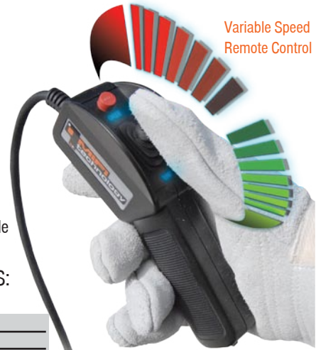
Variable Speed Remote Control