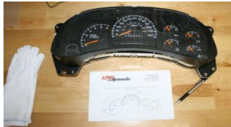
2. Make sure you have the needle positions marked. Should all be at low.