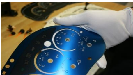
14. Only hold the gauge face by the edges.