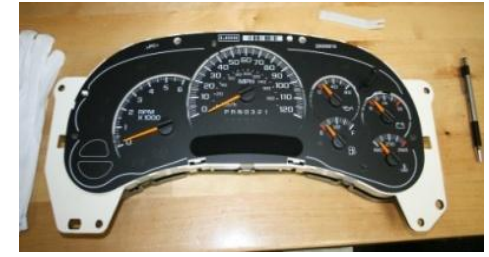
4. Cluster with the lens off.