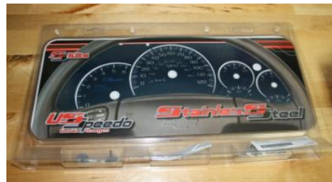
11. Open the US Speedo gauge face package.