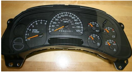
1. Bring cluster inside to a clean area to start the install.