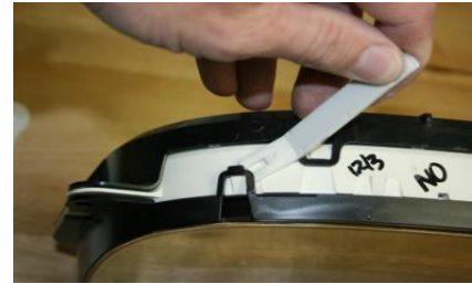
3. Use the needle tool to help remove the clear lens.