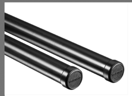
CROSS BARS (#8000409)

*Minor modifications may need to be made to the base mount plate