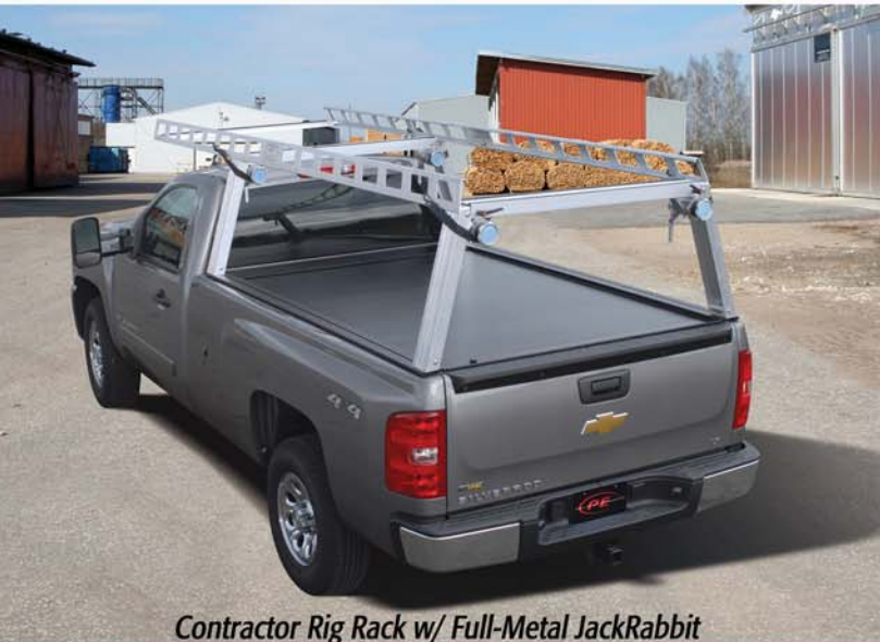
Contractor Rig Rack w/ Full-Metal JackRabbit