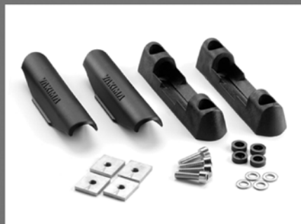
LANDING PAD (#8000221 x2)

The below Yakima Parts work (with minor modifications) with Pace Edwards ExplorerSeries Rails.