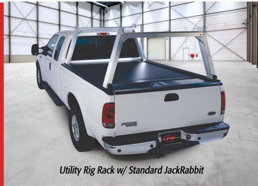
Utility Rig Rack w/ Standard JackRabbit