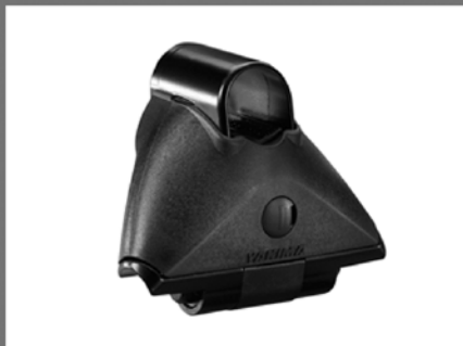
CONTROL TOWER (#8000214)