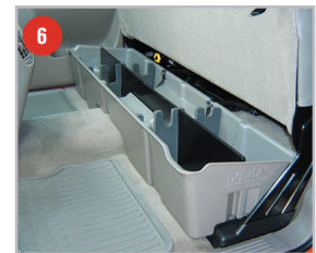
This is how the DU-HA should look installed under the back seat.