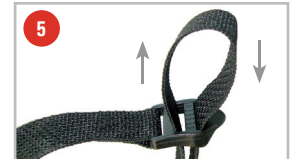
Ribs on buckle should face up. Thread strap through buckle as shown.