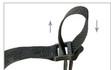
Ribs on buckle should face up. Thread strap through buckle as shown.